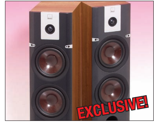
DALI LEKTOR 6 loudspeakers