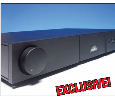
NAIM NAIT XS integrated amplifier