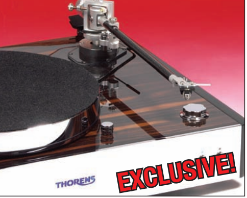
THORENS TD550 ultimate turntable

FREE READER CLASSIFIED ADS IN THIS ISSUE!